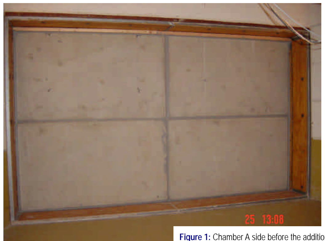
Figure 1: Chamber A side before the addition of Furring channels and plasterboard